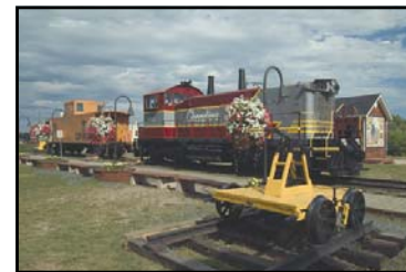
Lake of the Woods Railroad Museum - Lakeview Drive

Both museums are kid friendly and sure to keep anybody engrossed no matter what the interest level or knowledge of the area. Be sure to make the museums part of your visit as you will not be disappointed.