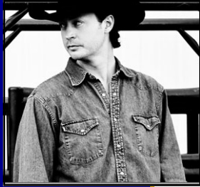
Canadian Performing Artist to play live at Harbourfest!