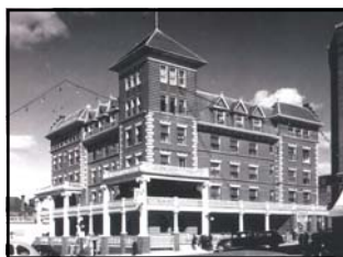
Relive the glory of the past at the Lake of the Woods Museum - Main St. Kenora

The timeline begins at the top with a collection of aboriginal artifacts such as bead-